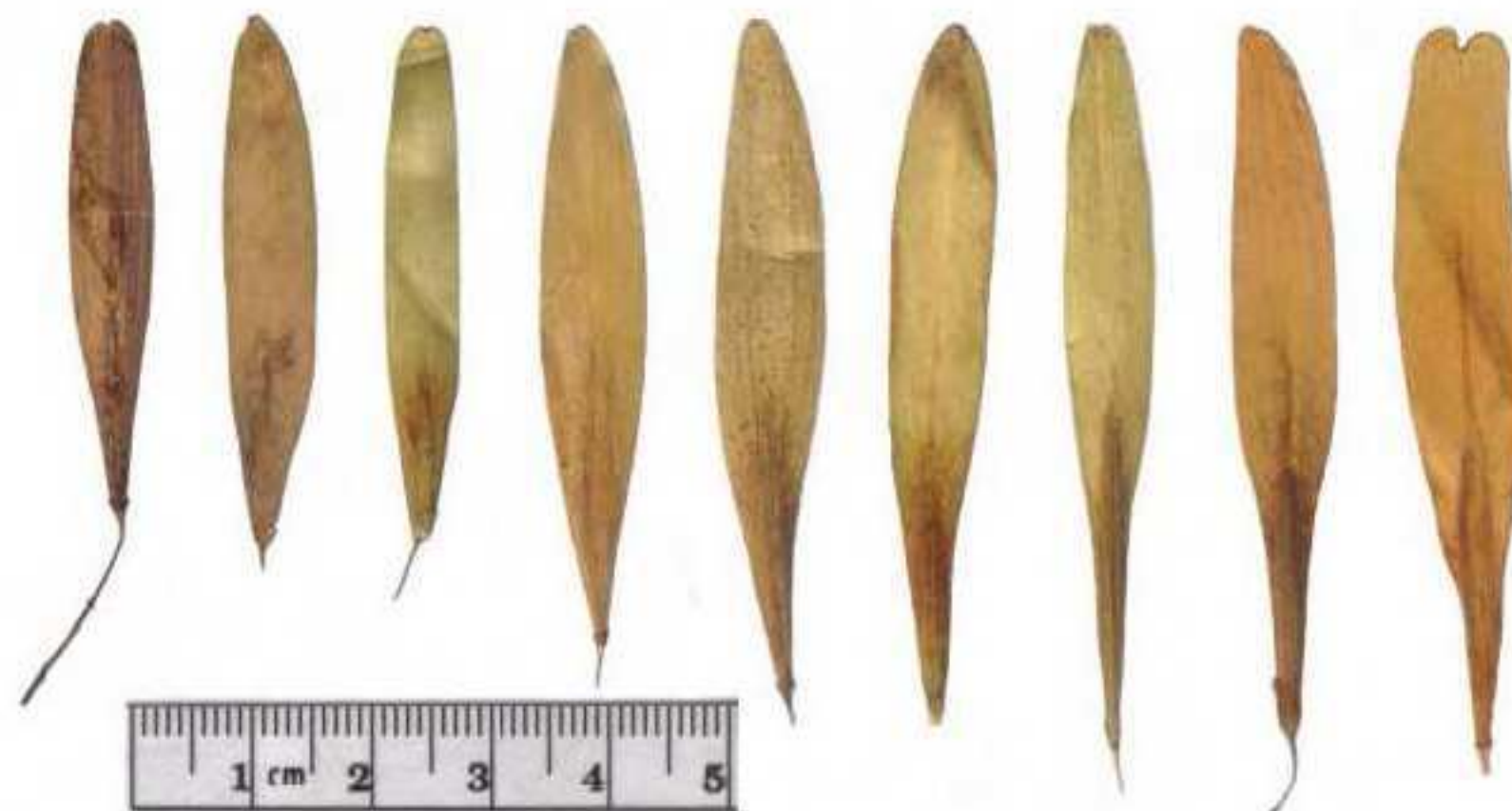
Figure 1. Samara variation in Fraxinus profunda .